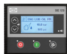
DEIF SGC 120