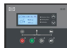
DEIF SGC 420