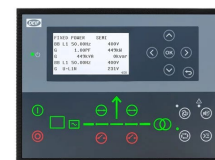
DEIF AGC 150