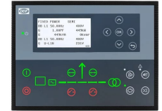
DEIF AGC 150