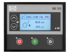
DEIF SGC 120