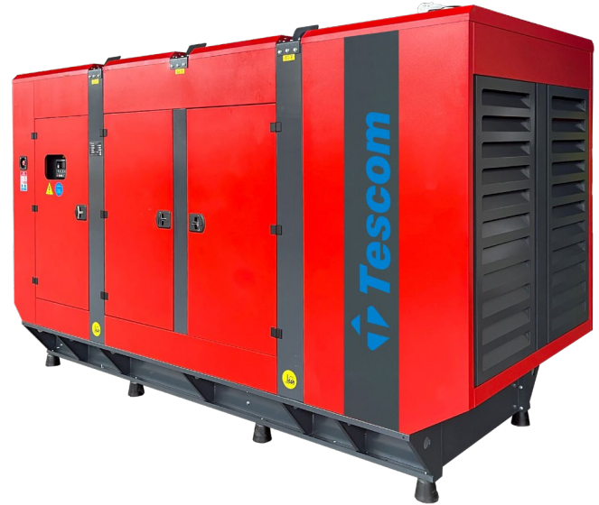
* The image is for illustrative purposes only. It may vary depending on the power rating.