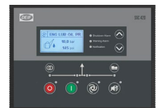
DEIF SGC 420