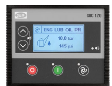
DEIF SGC 120