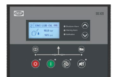
DEIF SGC 420