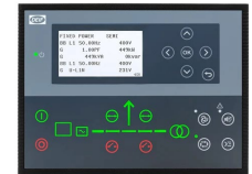
DEIF AGC 150