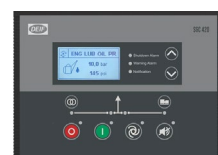
DEIF SGC 420