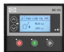
DEIF SGC 120