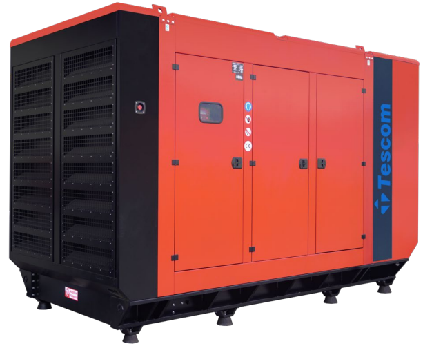
* The image is for illustrative purposes only. It may vary depending on the power rating.