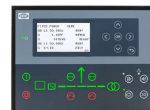
DEIF AGC 150