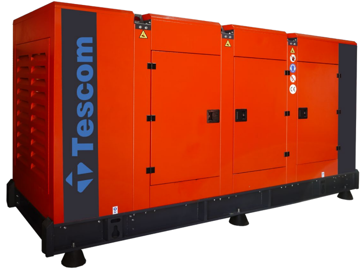
* The image is for illustrative purposes only. It may vary depending on the power rating.