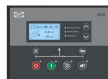
DEIF SGC 420