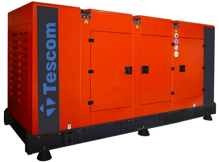
* The image is for illustrative purposes only. It may vary depending on the power rating.