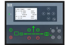
DEIF AGC 150