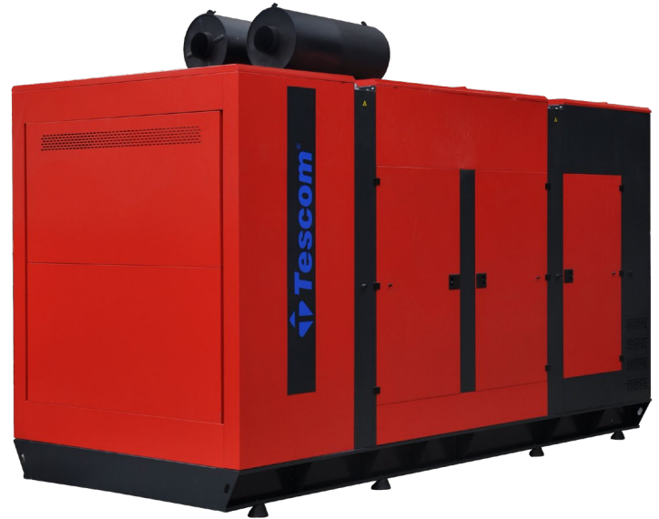
* The image is for illustrative purposes only. It may vary depending on the power rating.