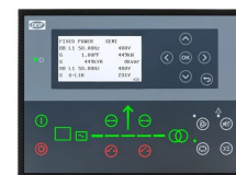
DEIF AGC 150