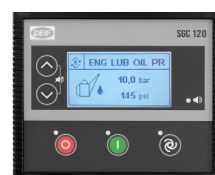
DEIF SGC 120