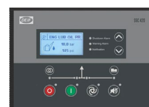
DEIF SGC 420