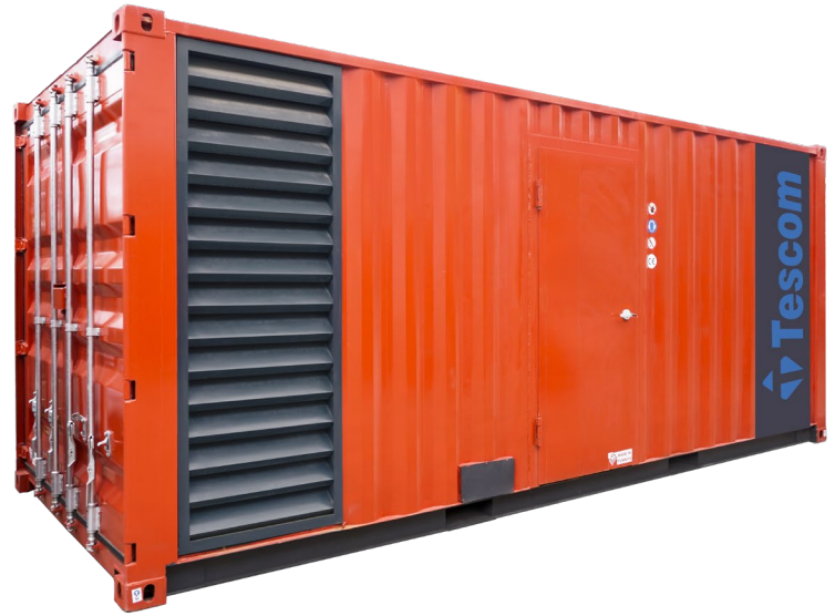
* The image is for illustrative purposes only. It may vary depending on the power rating.