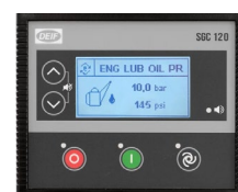
DEIF SGC 120