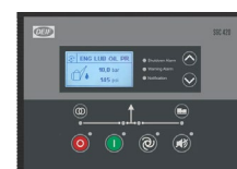
DEIF SGC 420